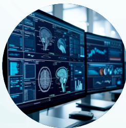
Real-Time Clinical Command Center