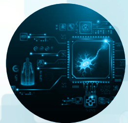
Generative AI- Augmented Clinical Decision Support