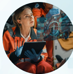
Intelligent Emergency Response & Orchestration